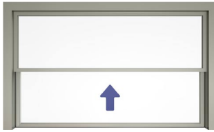
Window with one sliding section