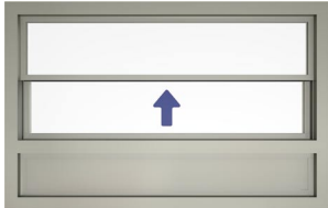
Fixed aluminium section below the window