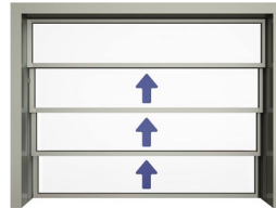
Window with three sliding sections