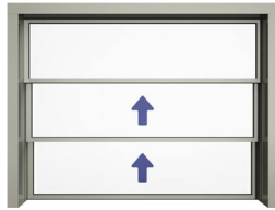
Window with two sliding sections