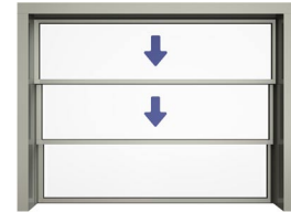
Window with two sliding sections opening downwards