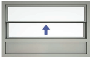
Fixed aluminium section below the window