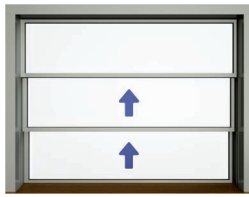
Window with two sliding sections