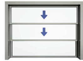
Window with two sliding sections opening downwards